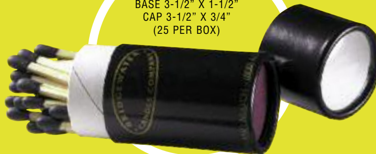
#1007 MATCH TUBE BASE 3-1/2" X 1-1/2" CAP 3-1/2" X 3/4" (25 PER BOX)