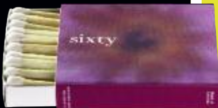
#1014 UNI 1-3/4" X 1-1/2" X 3/8" (22 PER BOX)