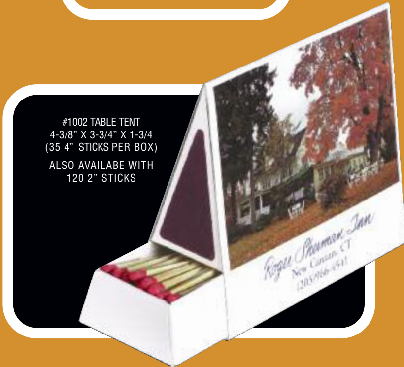
#1002 TABLE TENT 4-3/8" X 3-3/4" X 1-3/4" (35 4" STICKS PER BOX)