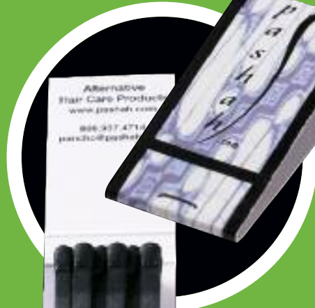
#2029 12-STRIKE 1" WIDE