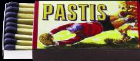
#1020 ANDORRA 2-1/4" X 1-3/8" X 3/8" (24 PER BOX)