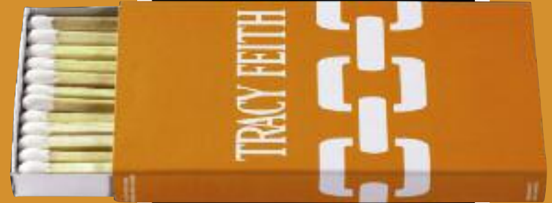
#1026-3L CLASSIC EXTRA LONG 3-5/16" X 1-7/8" X 3/8" (24 3" STICKS PER BOX)