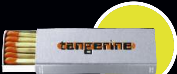
#1016 MADAME 2-1/4" X 15/16" X 5/16" (10 PER BOX)