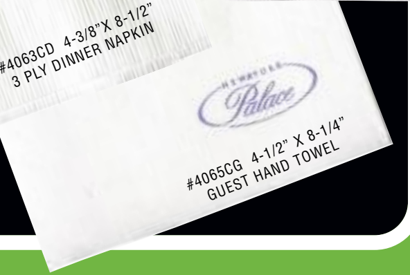
#4065CG 4-1/2" X 8-1/4" GUEST HAND TOWEL