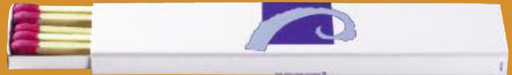
#1061 MADAME SUPER LONG 4-1/2" X 15/16" X 5/16" (8 4" STICKS PER BOX)