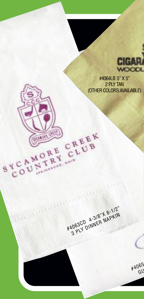
#4063CD 4-3/8" X 8-1/2" 3 PLY DINNER NAPKIN