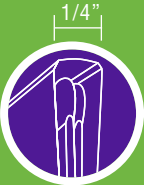
#2015 15-STRIKE 2-1/8" WIDE, SINGLE ROW