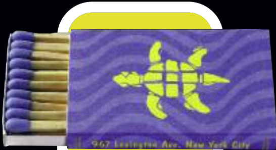
#1025 CELEBRITY SLIM 2-1/4" X 1-5/8" X 1/4" (20 PER BOX)