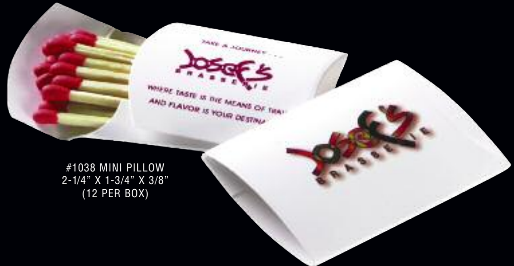
#1038 MINI PILLOW 2-1/4" X 1-3/4" X 3/8" (12 PER BOX)