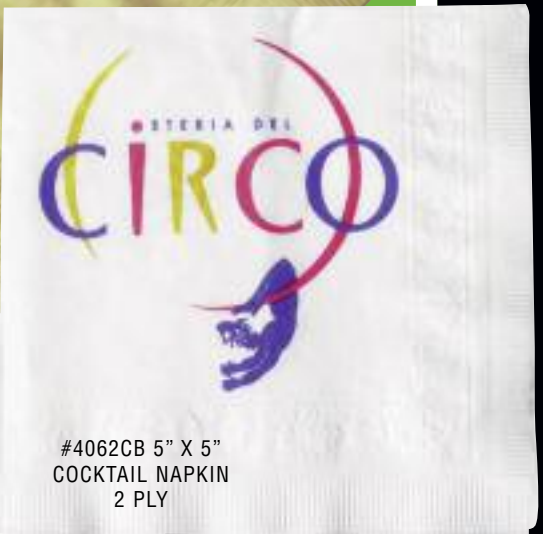
#4062CB 5" X 5" COCKTAIL NAPKIN 2 PLY