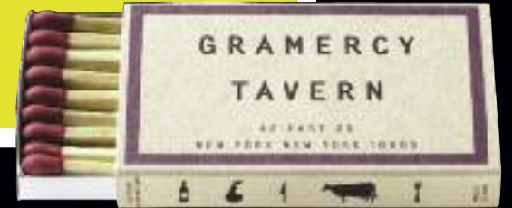
#1022 ANDORRA SLIM 2-1/4" X 1-3/8" X 5/16" (18 PER BOX)