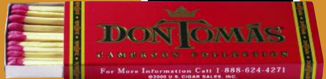
#1051 CLASSIC SUPER LONG 4-1/2" X 1-7/8" X 3/8" (24 4" STICKS PER BOX)