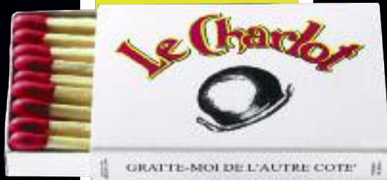
#1023 CELEBRITY 2-1/4" X 1-5/8" X 3/8" (27 PER BOX)