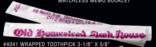
#4041 WRAPPED TOOTHPICK 3-1/8" X 5/8"