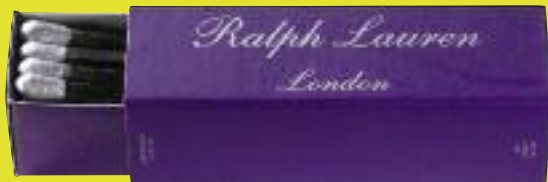
#1010 ASCOT 2-1/4" X 3/4" X 3/4" (22 PER BOX)

NO CHARGE: YOUR CHOICE OF MATCH TIP COLOR ON 2" NATURAL WOOD STICKS. OPTIONAL BLACK OR COLORED WOOD STICKS WITH UP-CHARGE.