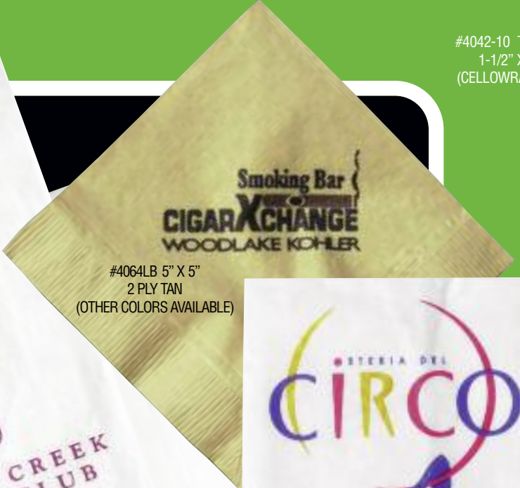
#4064LB 5" X 5" 2 PLY TAN (OTHER COLORS AVAILABLE)