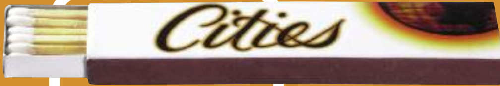
#1063 ESCORT SUPER LONG 4-1/2" X 1-1/8" X 3/8" (12 4" STICKS PER BOX)