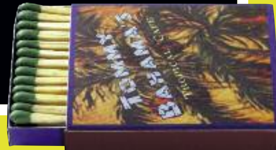
#1026 CLASSIC 2-1/4" X 1-7/8" X 3/8" (34 PER BOX)