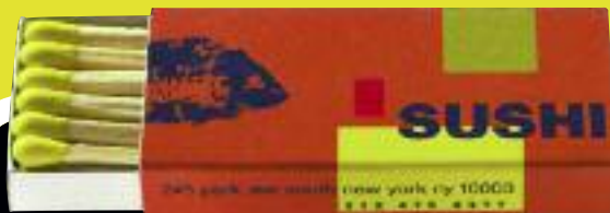
#1018 ESCORT 2-1/4" X 1-1/8" X 3/8" (16 PER BOX)