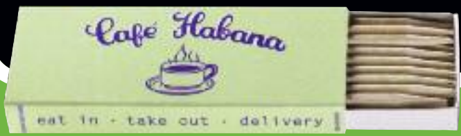
#4044 BOXED TOOTHPICKS 2-3/4" X 1" X 5/16" (choose 10 or 20 picks)