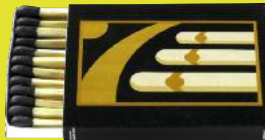
#1028 CLASSIC SLIM 2-1/4" X 1-7/8" X 1/4" (25 PER BOX)